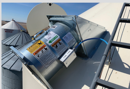
Roof exhaust fans to assist in reducing condensation when in-bin drying

Call us for any service / training questions or concerns about your grain monitoring system.