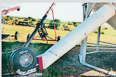
KEHO fans and Air Tubes to provide portability and easy hookup