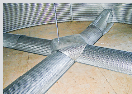
1/2 Round Cross Duct

Give us a call for more information on how these products will maximize your profits